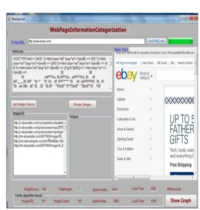
Fig 8: Source and Url in WPIC Approach