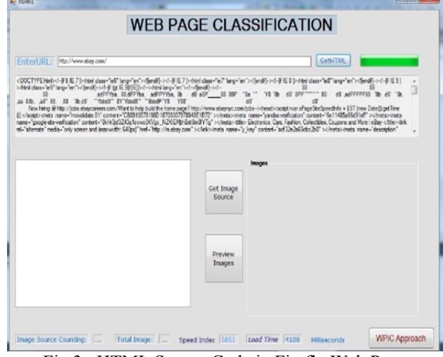
Fig 3: HTML Source Code in Firefly Web Page Categorization Implementation