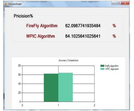
Fig 11: Pricision between Firefly Web Page Classification and WPIC Approach

Above representation shows graphical analysis between firefly classification and WPIC classification where we compare all four parameters URL comparison, Image comparison, Fetching time comparison and speed comparison.