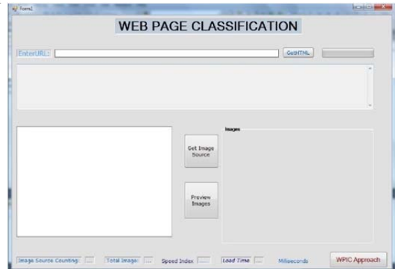
Fig. 2: Firefly Web Page Categorization

Following screenshots represent Firefly work implementation: